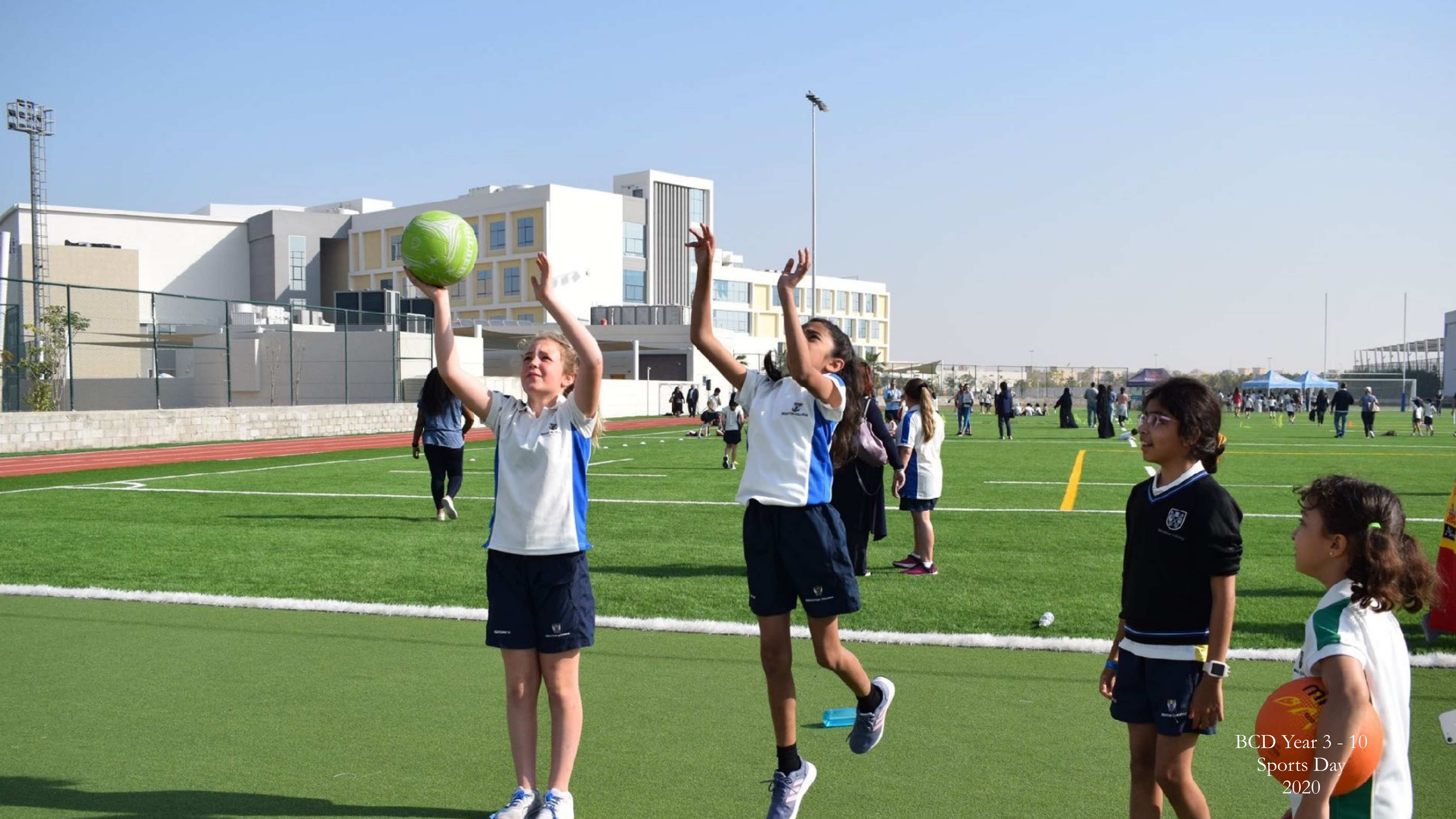
BCD Year 3 - 10 Sports Day 2020