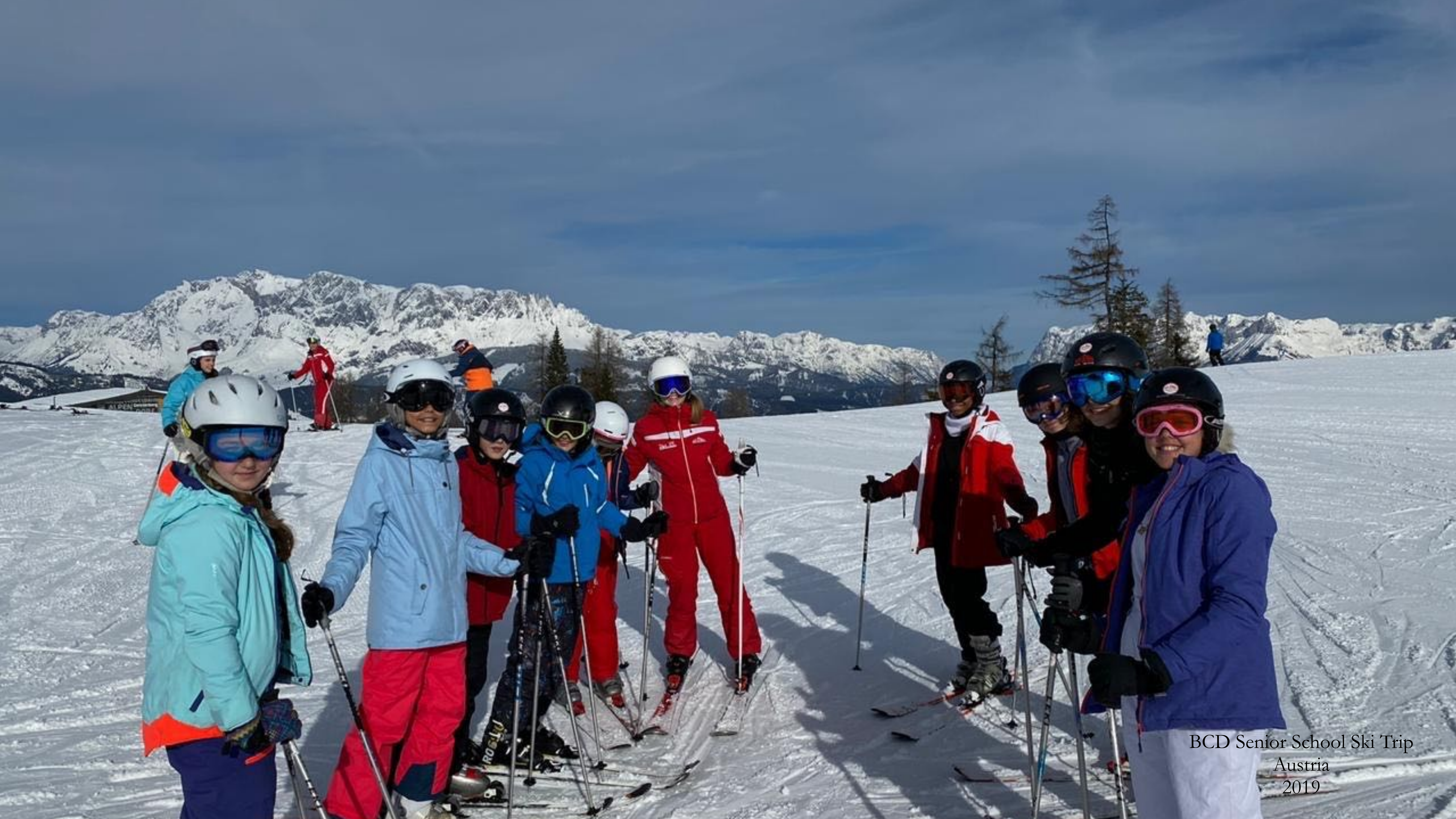
BCD Senior School Ski Trip Austria 2019